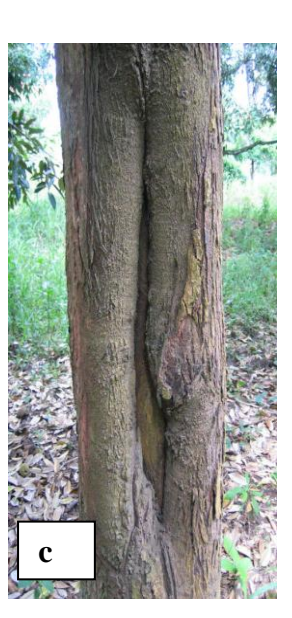
Figure 4. Portions of infected trees treated with Trichoderma harzianum (a) 1 month, (b) 12 months and (c) 36 months