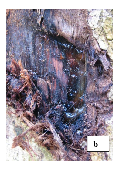
Figure 1: Infected durian trees showing necrotic lesions (a) and gummosis (b)

The trees applied with sterile distilled water resulted to the recurrence of the disease (Figure 2).