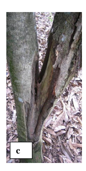
Figure 3. Portions of infected trees treated with Aliette (a) 1 month, (b) 12 months and (c) 36 months